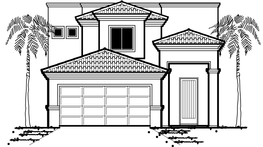
LIVING AREA: 1880 S.F.