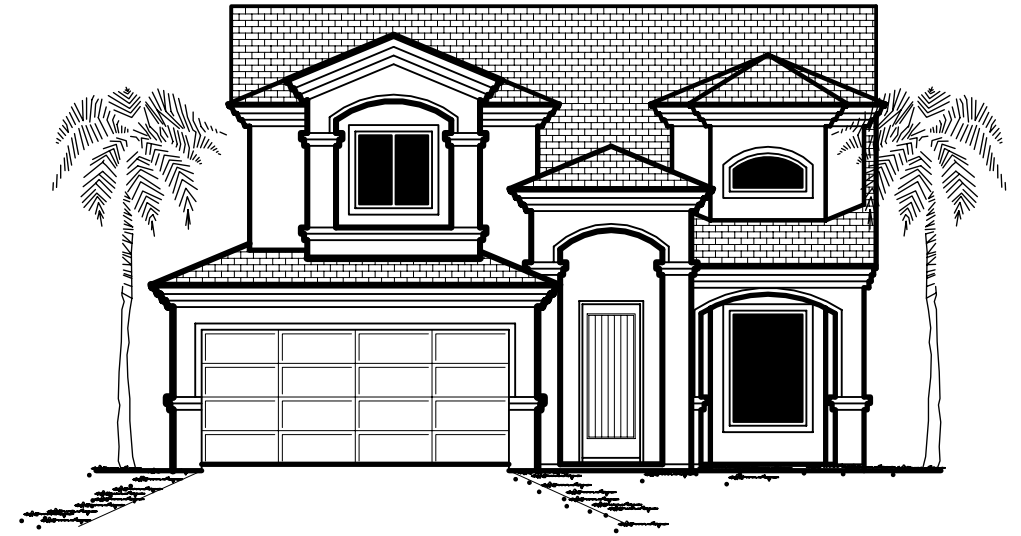
FRONT ELEVATION LIVING AREA: 1900 S.F.